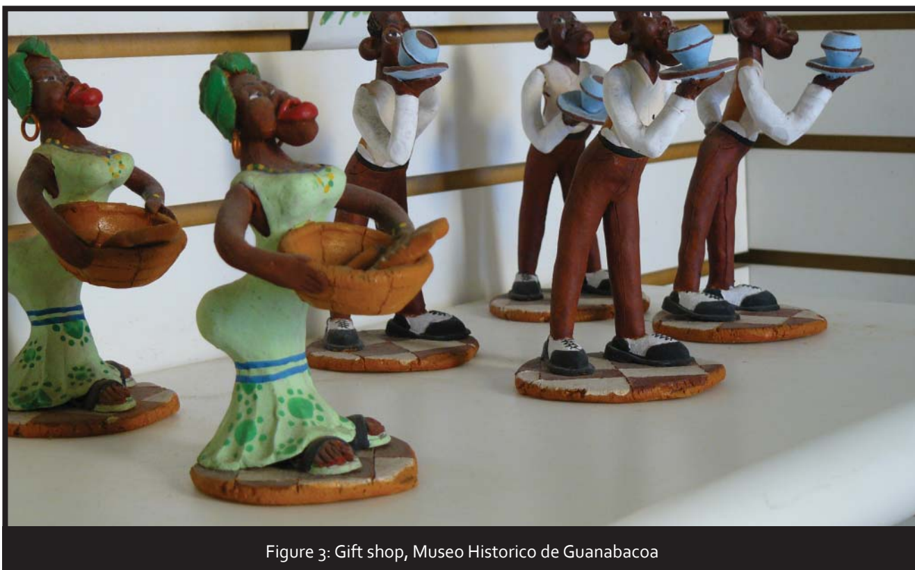
Figure 3: Gift shop, Museo Historico de Guanabacoa

Occupying a slightly different niche in the tourist imaginary are several younger, more nubile women enacting the roles of colonial-era vendors, dressed in colorful flowing gowns, bearing baskets of